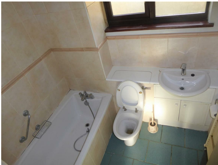
White suite comprising tiled enclosed bath with mixer taps, wash hand basin, low level w/c, tiled walls, heated towel rail, double glazed window.