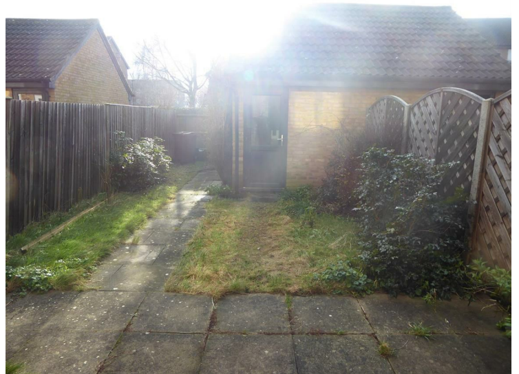
Paved patio area, rest laid to lawn, rear access and access to hardstanding off street parking and brick built garage.