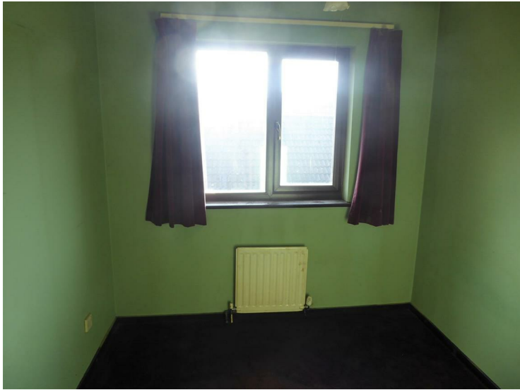
Rear aspect double glazed window, radiator, power point.